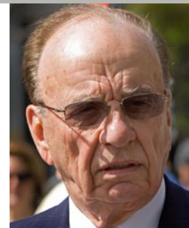
Media mogul with Berlusconi ambitions