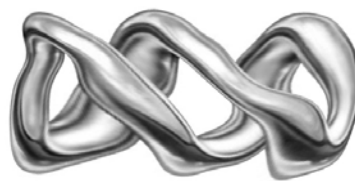
Murdoch's vision for the ABC

government to change the legislation creating the ABC to restrict the public broadcaster from collecting its own news. (RN Background Briefing 4/10/09). In order to protect the sales of evening newspapers there was also an arrangement that news was not broadcast until later in the evening. As the importance of broadcasting developed newspapers allied themselves with broadcasters. One example of this was the Herald and Weekly Times Limited, under Sir Keith Murdoch, taking over