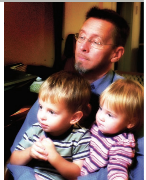
You can view and participate in the ABC's arts website at www.abc.net.au/arts

Cuts to the ABC's already meagre television arts programming are an abrogation of the ABC's charter responsibilities. For the arts to thrive and enrich the life of Australia and all of its citizens, they must be central to what the ABC does. They must be a prominent and integral part of its content across all platforms – online, radio and television.